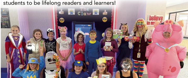
Our winners came dressed as their favorite book character.